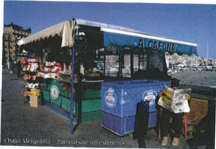
Chafet Mergellina – harbour-side refreshments