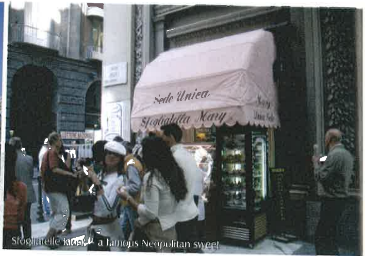
Sfogliatelle stand – a famous Neapolitan sweet

They say if you can drive in Naples, you can drive anywhere. This is because the rules of the road are completely ignored!