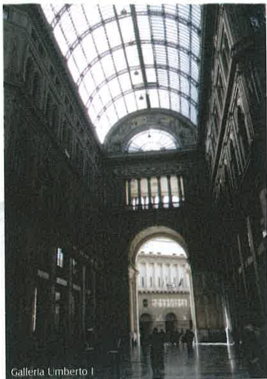
Galleria Umberto I

One of Naples' unique locations is the 'Spanish Quarter'. This area, very close to the centre, is a chessboard-like network of streets rising from via Toledo (which bears the name of the Viceroy, Don Pedro de Toledo, who ordered its construction) to the hill of San Martino. At one time this was the site of the encampments of the Spanish military garrisons, hence the name 'Spanish Quarter'. It is well worth a visit, but it is best to go with at least one other person. Apart from anything else, it is very easy to get lost but a good guide will help you to understand and appreciate the attractions of the area. The website www.ilvagabondo.org organises excellent guided tours of the Spanish Quarter at 10 euros per person. 'Il Vagabondo' (+39) 081 5447821 or (+39) 347 4494905 ( viaggi@ilvagabondo.it )