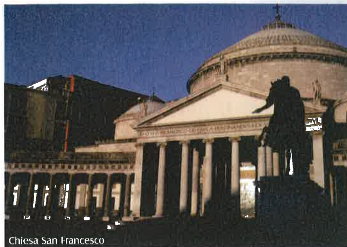
Chiesa San Francesco

To the tourist, Naples gives the impression of a colourful city, marked by close human contact and an amusing and picturesque sense of disorganisation, but it is also a place where